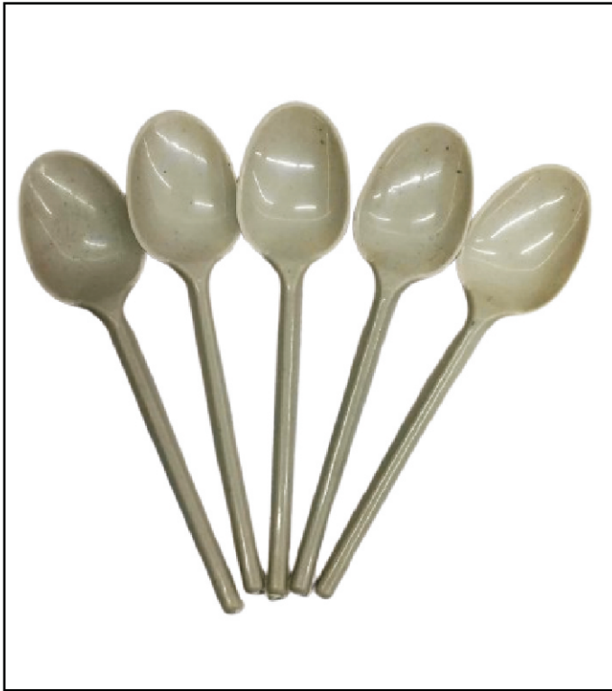
ADI spoon (2nd) (s)