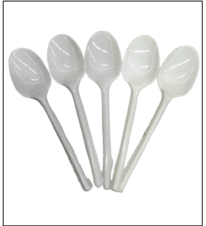
ADI spoon (1st) (s)